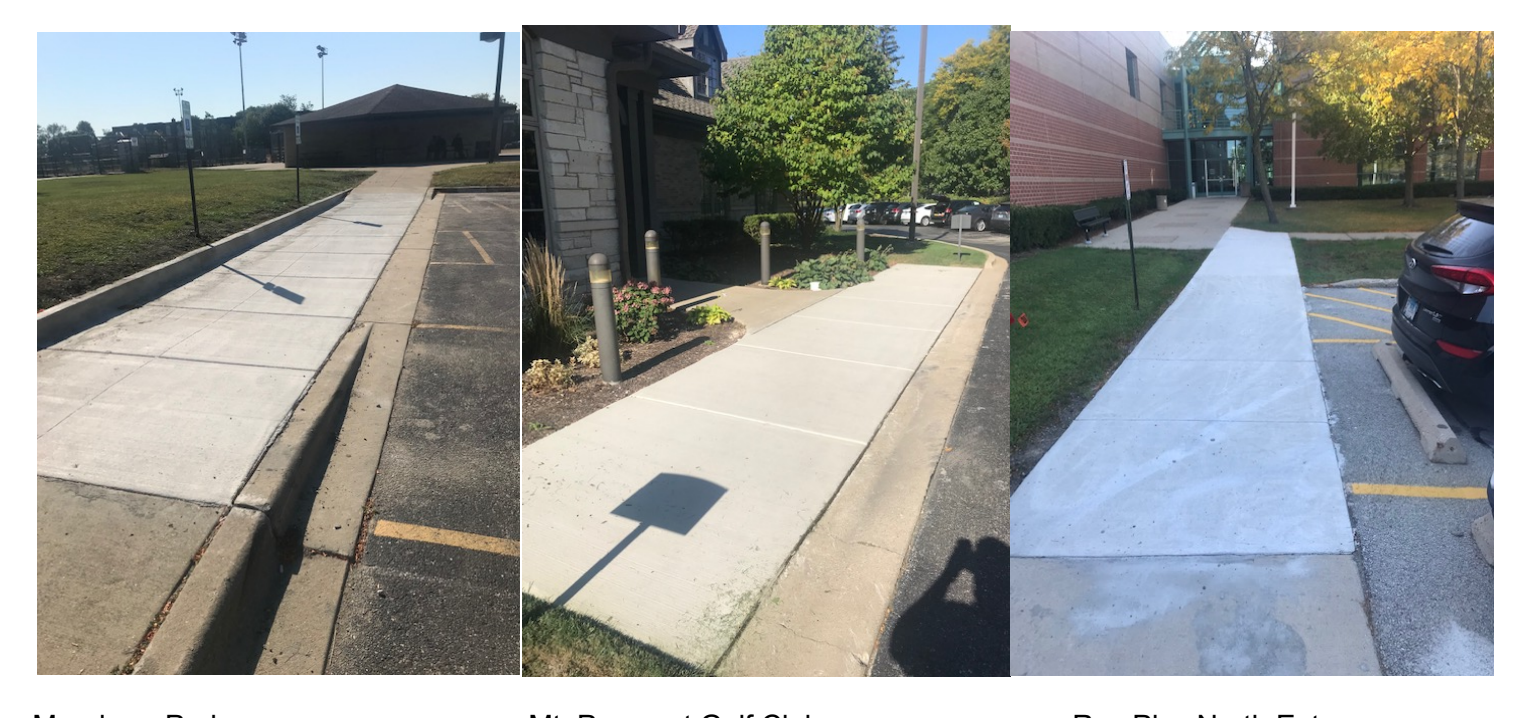
Meadows Park Mt. Prospect Golf Club Rec Plex North Entry