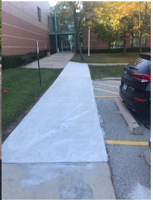
Rec Plex North Entry