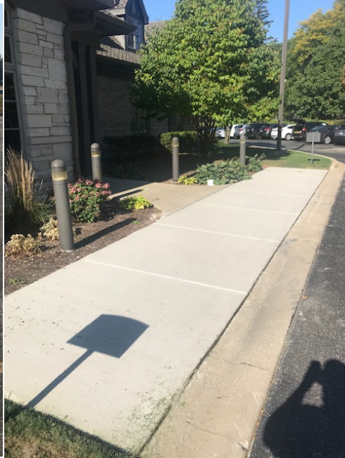
Mt. Prospect Golf Club