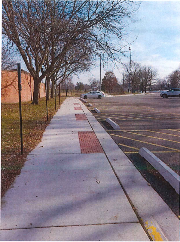
Rolling Meadows Park District - Nelson Sports Complex sidewalk addition